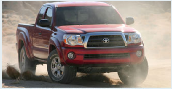
Access Cab 4x4 V6 shown in Impulse Red with available TRD Off-Road Package