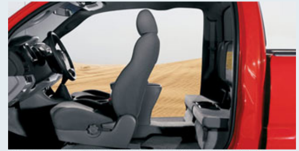
4x4 Access Cab V6 interior shown in Graphite with available TRD Off-Road Package