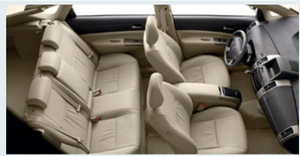
Prius interior shown in Bisque leather with available Package #6.