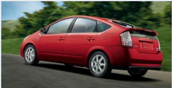
Touring shown in Barcelona red metallic

Prius shown in Magnetic Gray Metallic with available Package #4.