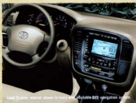
Land Cruiser interior shown in Ivory with available DVD navigation system.