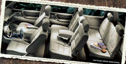
Land Cruiser interior shown in Ivory.