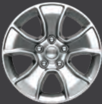
17-INCH SILVER OFF-ROAD WHEEL (10) [ 77072472AB ]