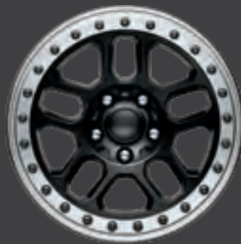
17-INCH BEADLOCK- CAPABLE WHEEL (10) [ 77072494AB ]