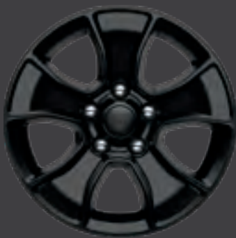
17-INCH BLACK OFF-ROAD WHEEL (10) [ 77073002AA ]