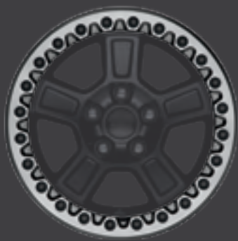
FUNCTIONAL BEADLOCK RING KIT (2)(11) Shown on 17-inch Beadlock-Capable Wheel. [ 77072586AA - BFGoodrich® tire ] [ 77072599AA - Falken® tire ]