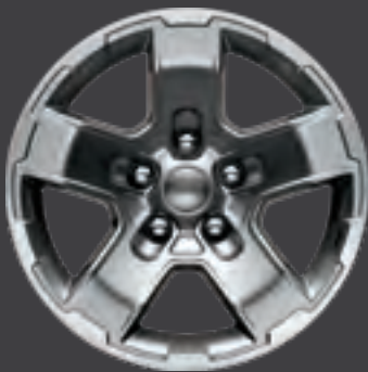
17-INCH GEAR DESIGN OFF-ROAD WHEEL (10) [ 77072471AB ]