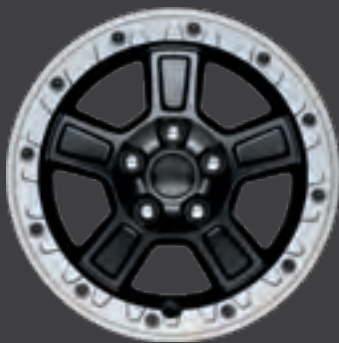
17-INCH BEADLOCK- CAPABLE WHEEL (10) [ 77072585AA ]