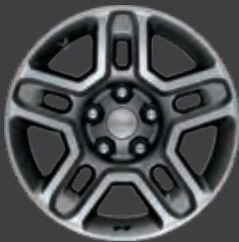
17-INCH SLOTTED OFF-ROAD WHEEL (10) [ 77072494AB ]