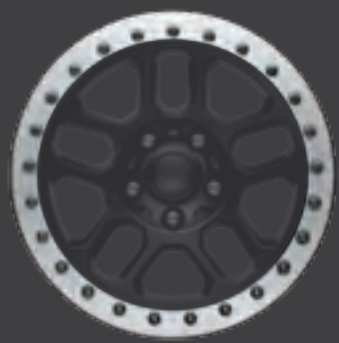
FUNCTIONAL BEADLOCK RING KIT (2) Shown on 17-inch Beadlock-Capable Wheel. [ P5160154AA ]