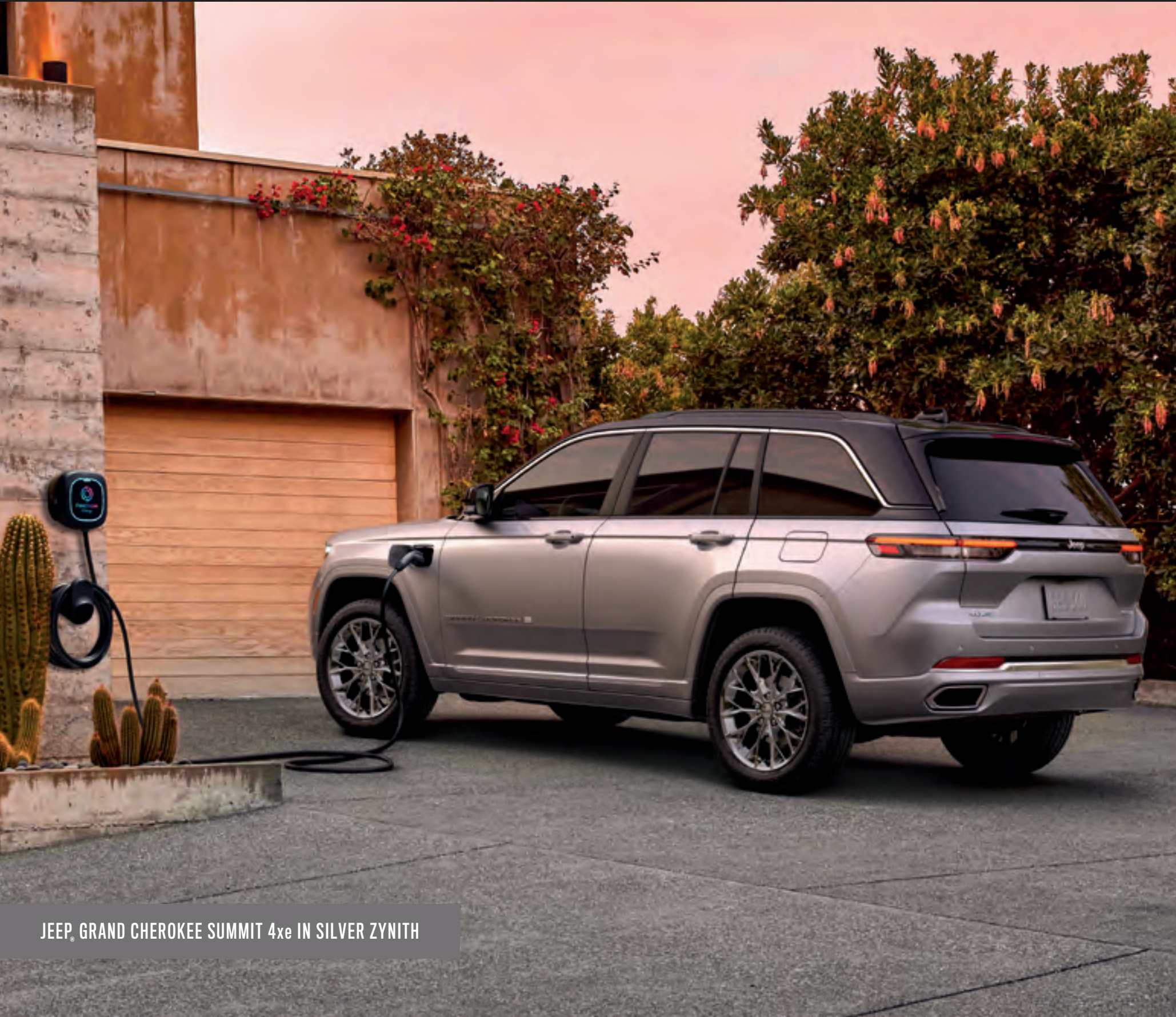
JEEP® GRAND CHEROKEE SUMMIT 4xe IN SILVER ZYNITH