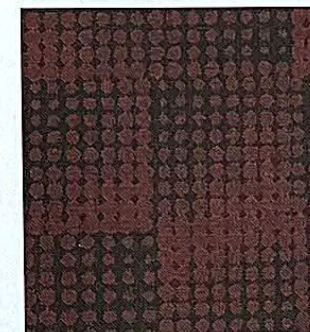
> Red designer sports trim

This brochure is designed to provide you with a general introduction to the Ford Products referred to, and should be read in conjunction with the latest specification sheet. Because of changes in conditions and circumstances Ford* reserves the right, subject to all applicable laws, at any time, at its discretion, and without notice, to discontinue or change the features, designs, materials, colours and other specifications and the prices of their products, and to either permanently or temporarily withdraw any such products from the market without incurring any liability to any prospective purchaser or purchasers. The latest Specification sheet should be referred to for information on the availability, ordering and use of optional equipment. Always consult an authorised Ford Dealer for the latest information with respect to features, specifications, prices, optional equipment and availability before deciding to place an order. *FORD MOTOR COMPANY OF AUSTRALIA LIMITED. (ABN 30 004 116 223) Registered Office: 1735 Sydney Road, Campbellfield, Victoria 3061, Australia. Printed October 2004.