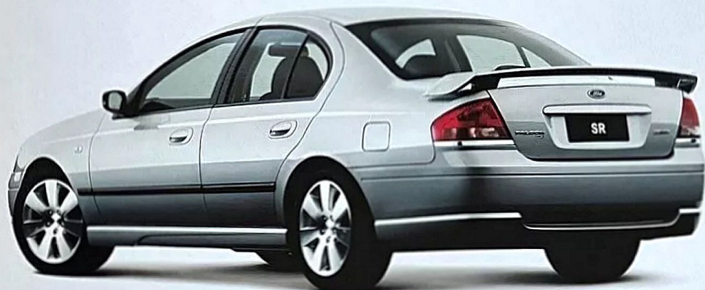
[ Falcon MkII SR. ]

> One look at the limited edition Falcon MkII Classic and it's hard not to be impressed. Discover it comes with over $6,000* of extra value and you'll be even more impressed. This extra value includes Sequential Sports Shift automatic transmission, 16" alloy wheels, designer sports trim, and rear power windows. But it doesn't stop there. With a DVD Entertainment System, rear seat passengers can watch their favourite DVD, or listen to music via the infrared headphones (supplied). At the same time, the driver and front passenger can enjoy the six stack CD player. Falcon MkII Classic, with over $6,000* of extra value. Can't get enough of this.