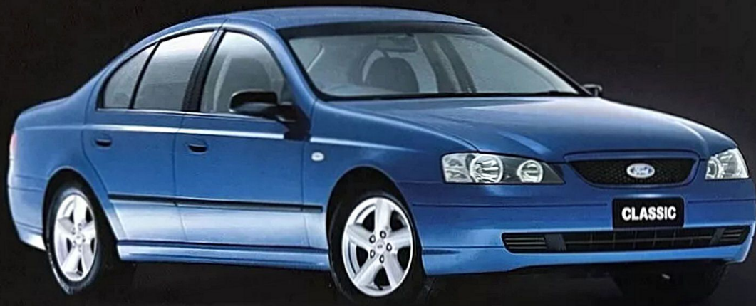
[ Falcon MkII Classic. ]