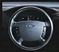
> Sports-style leather wrapped steering wheel.

> Equally impressive is the limited edition Falcon MkII SR. Which is no surprise considering it also boasts over $6,000* of extra value, including Sequential Sports Shift automatic transmission, designer sports trim, rear power windows and a six stack CD player. Plus there's Sports Control Blade IRS, a sports body kit with high arched rear spoiler, 17" alloy wheels and a leather wrapped steering wheel to complete the ultimate performance package. The sporty Falcon MkII SR, with over $6,000* of extra value. Can't get enough of this.