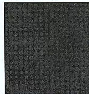
> Grey designer sports trim