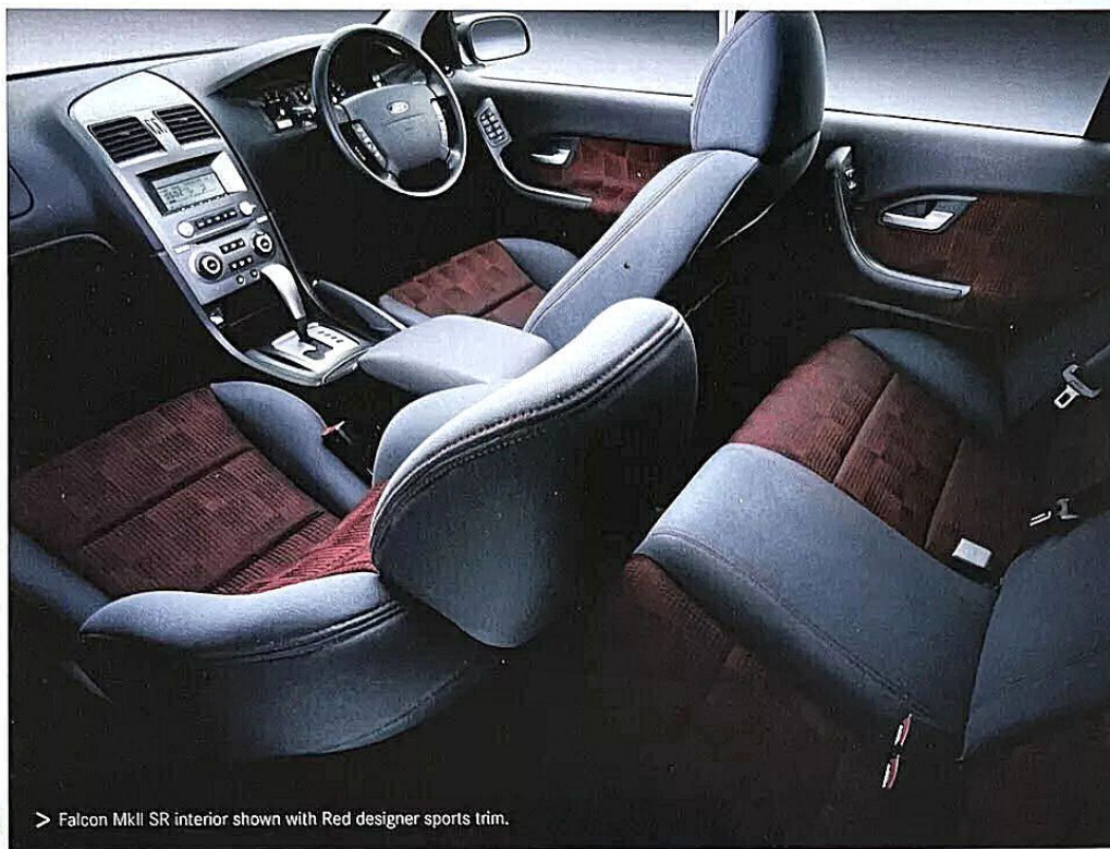
> Falcon MkII SR interior shown with Red designer sports trim.