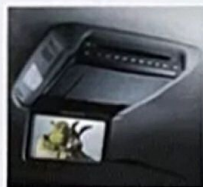
> DVD Entertainment System.

> One look at the limited edition Falcon MkII Classic and it's hard not to be impressed. Discover it comes with over $6,000* of extra value and you'll be even more impressed. This extra value includes Sequential Sports Shift automatic transmission, 16" alloy wheels, designer sports trim, and rear power windows. But it doesn't stop there. With a DVD Entertainment System, rear seat passengers can watch their favourite DVD, or listen to music via the infrared headphones (supplied). At the same time, the driver and front passenger can enjoy the six stack CD player. Falcon MkII Classic, with over $6,000* of extra value. Can't get enough of this.