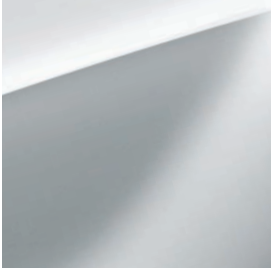
Snow White Pearl