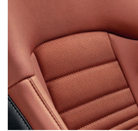
SX Carmine Red quilted leather (synthetic)