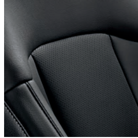
EX Black leather (synthetic)