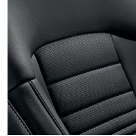
SX Black quilted leather (synthetic)