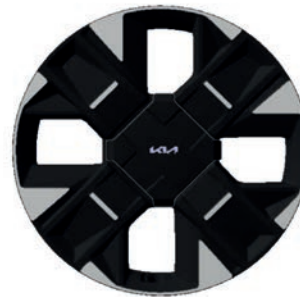
19" alloy wheels