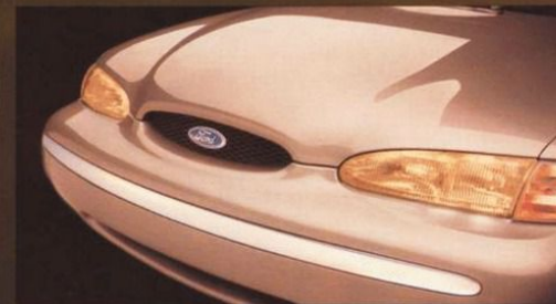
A supple new design.