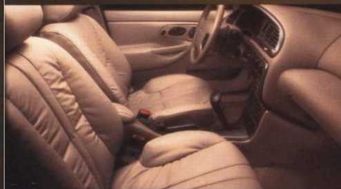
A pleasing environment.