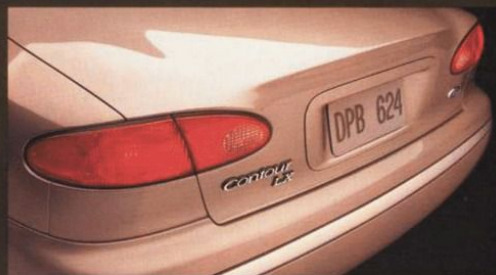
A distinctive look from any angle.