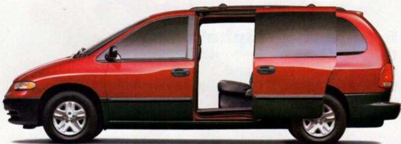
1997 Dodge Grand Caravan / 1997 Plymouth Grand Voyager - Long Wheelbase, Dual Sliding Doors.

For a limited time, you can get the second sliding door on any Chrysler Minivan, long or short, at no extra charge.*