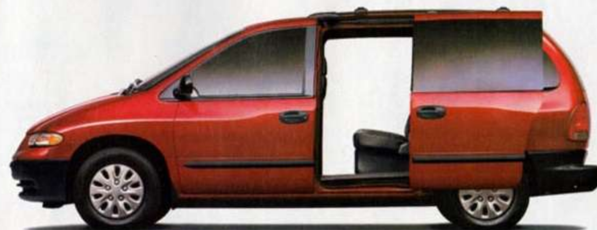
1997 Dodge Caravan / 1997 Plymouth Voyager – Short Wheelbase, Dual Sliding Doors.