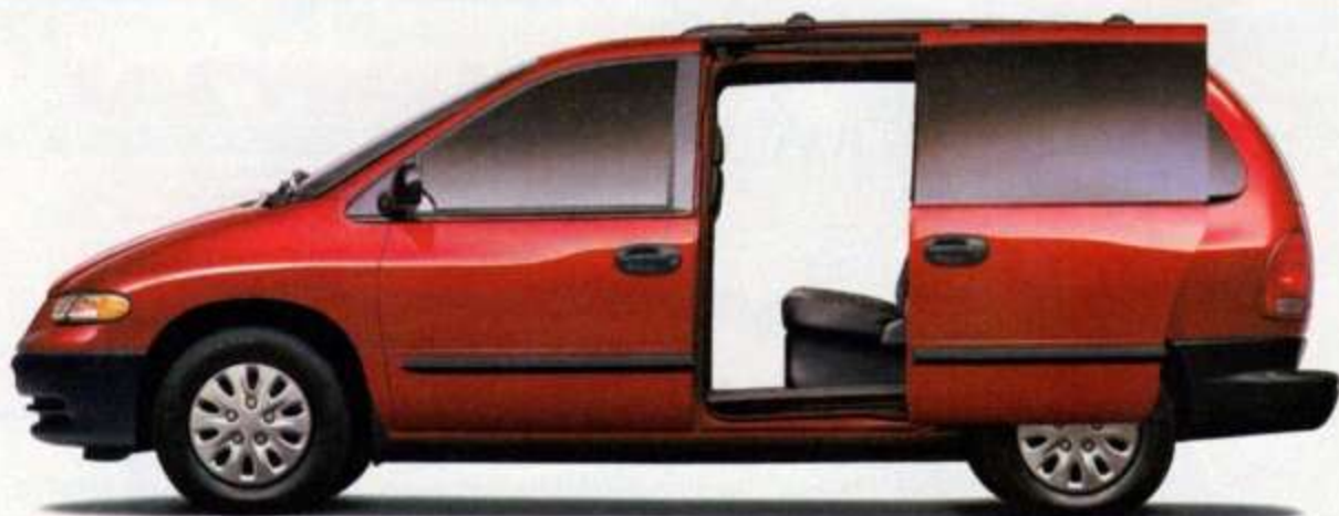
1997 Dodge Caravan/1997 Plymouth Voyager - Short Wheelbase, with Dual Sliding Doors.

For a limited time, you can get the second sliding door on any Chrysler Minivan, long or short, at no extra charge.*