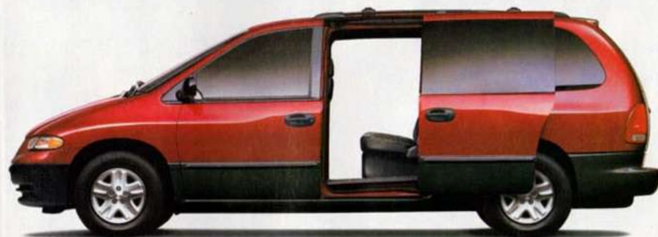
1997 Dodge Grand Caravan / 1997 Plymouth Grand Voyager – Long Wheelbase, Dual Sliding Doors.

Of course, we're talking about the convenience of a second sliding door. And no other minivan offers second sliding doors on both long and short wheelbase. (Most don't offer them at all.) That's why Chrysler minivans are still the Number One Choice for Canadian families. Precisely for what you'll find behind the doors: thirteen years of safety, innovation and leadership.