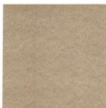
DORADO GOLD PEARL*