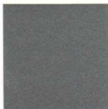
ASH BLUE MICA