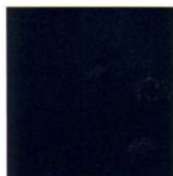
BLUE MERIDIAN PEARL