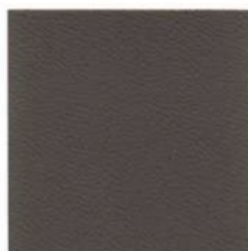
DARK CHARCOAL LEATHER