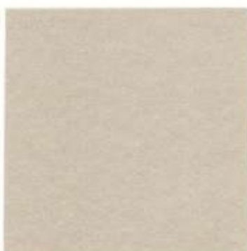
SAND DOLLAR PEARL