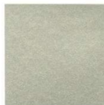
SILVER PINE METALLIC