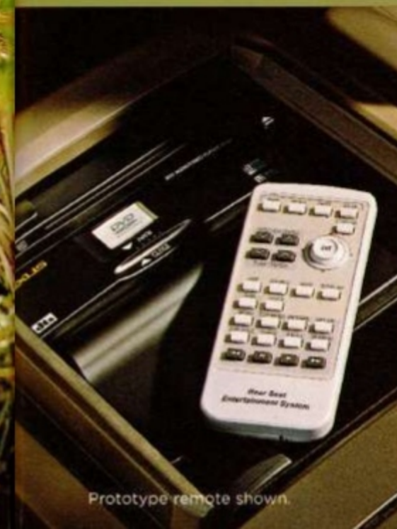
Prototype remote shown.