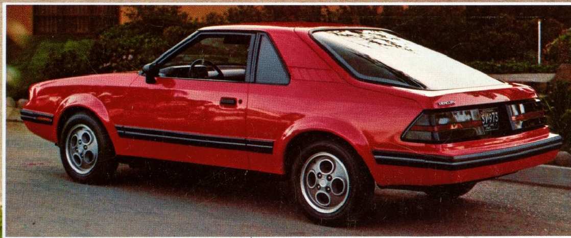
1982 LN7 3-Door Bubbleback