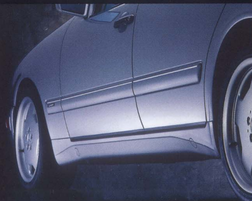
Side sill skirts