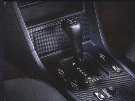
Sport-style interior trim and shift knob