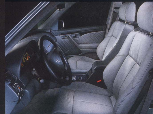
Leather upholstery and sport front seats