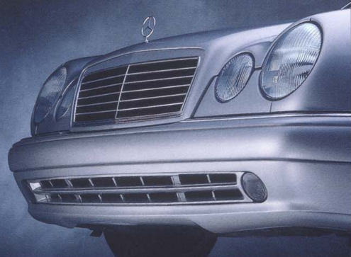
Contoured front air dam