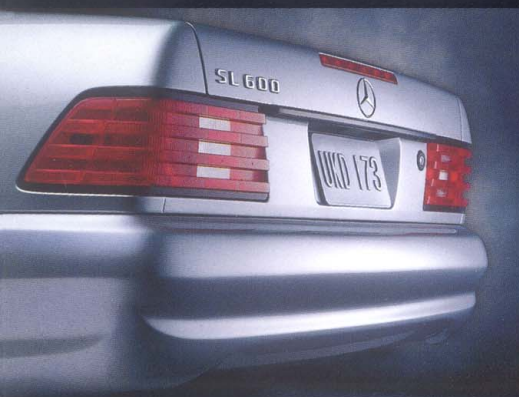
Extended rear apron