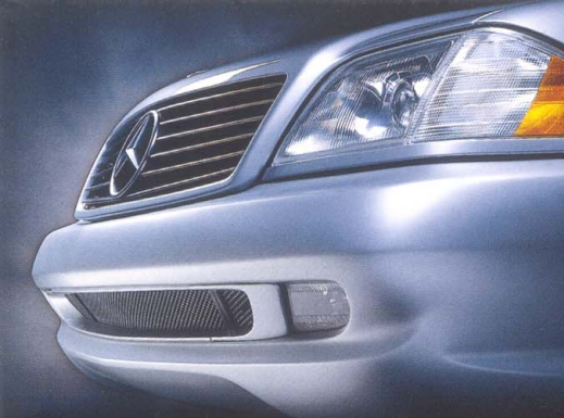
Modified front air dam with mesh grille