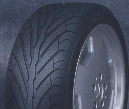
235/45ZR17 performance tires