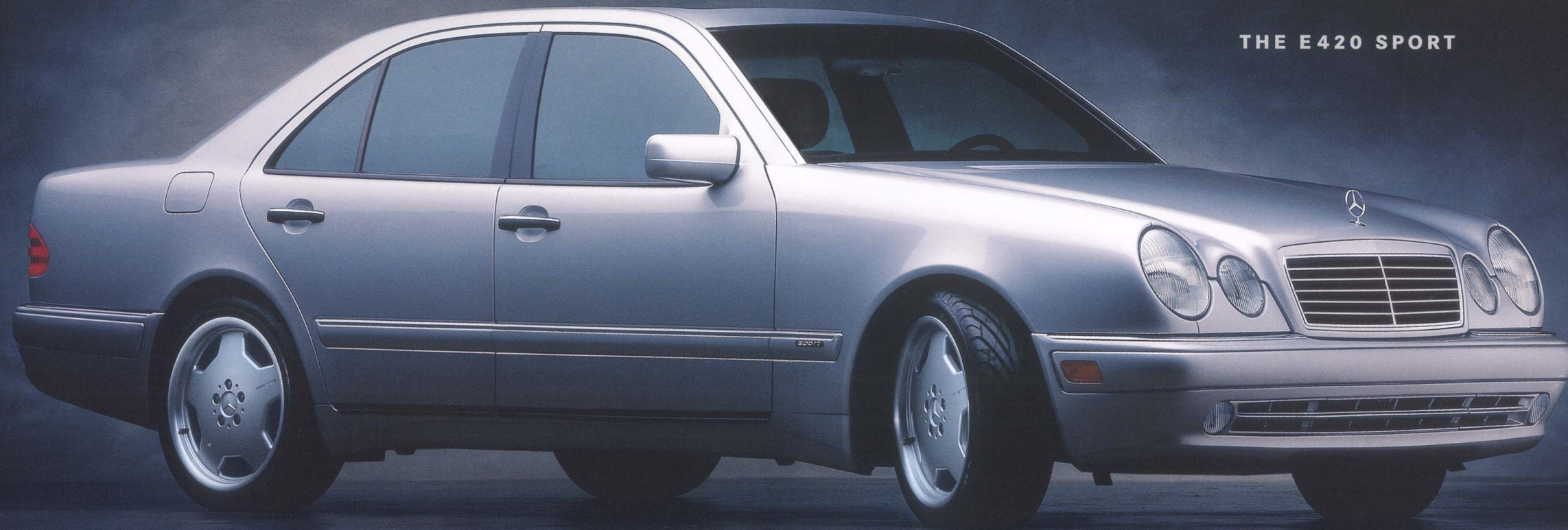
THE E420 SPORT