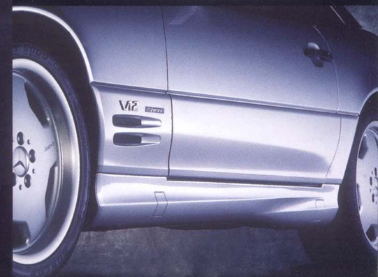
Sculpted side sill skirts