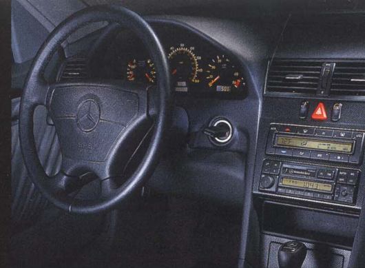
Sport steering wheel with telescoping column

curve and you'll feel the response of its faster-ratio steering, firmer stabilizer bars and shock absorbers, and low-profile tires on 7-inch wide alloys. Feel the leather upholstery: the sport front seats are bolstered for spirited cornering. Finally, one look at the price tells you this: the C280 Sport is a serious bargain.