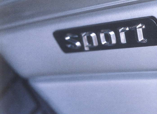
Monochromatic body trim