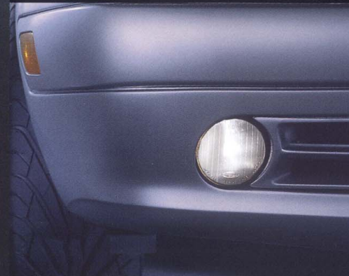
Projector-beam front foglamps

DRIVING IS A STATEMENT. How do you enhance the sensuous shape of the new E-Class? How do you add to the handling precision of its new rack-and-pinion steering? The answer, in brief, is pictured here: the 1997 E420 Sport, available in Spring of 1996. Consider the performance sedan credentials it comes with: a