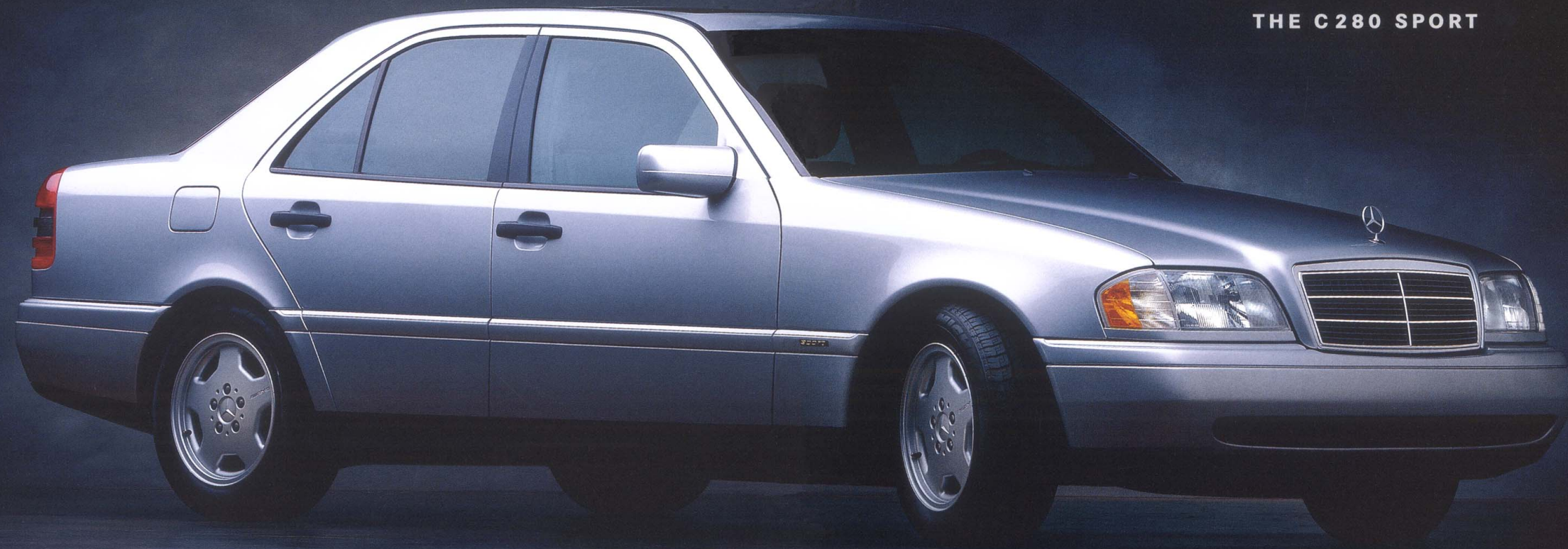
THE C280 SPORT

DRIVING IS A PASSION. One look at a C280 Sport tells you this Mercedes is not merely a luxury sedan. One drive and you'll know it's a serious driver's car. Grab the sport shift knob, press the throttle and its 6-cylinder engine taps into 195 hp and 199 lb-ft of torque. Turn the leather-trimmed sport steering wheel into a