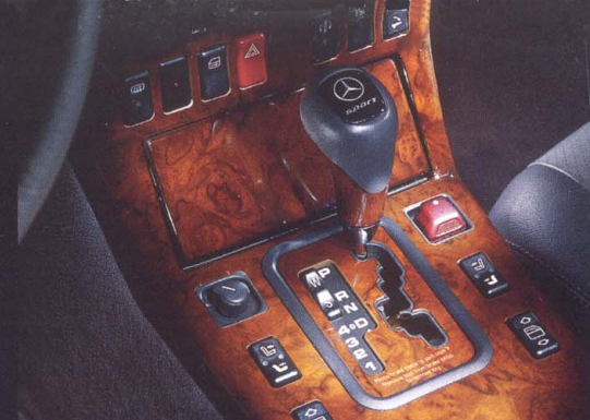
Sport shift knob (SL600 shown)

transformed from a sensuous coupe to a sporty roadster with a convertible soft top – while preserving the safety engineering of a Mercedes-Benz. The SL Sport models feature distinctive lower bodywork and ultra-low-profile Z-rated tires on 18-inch alloy wheels. Giving these SLs a look that is simply awe-inspiring.