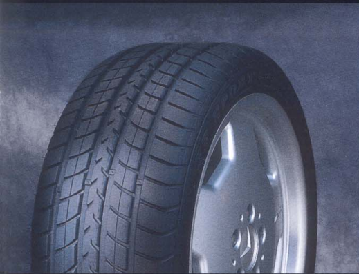
Z-rated 275/35 rear and 245/40 front tires