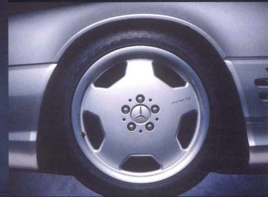
18-inch monoblock alloy wheels