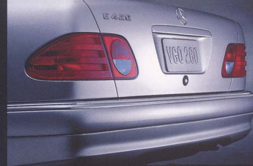
Sculpted rear apron