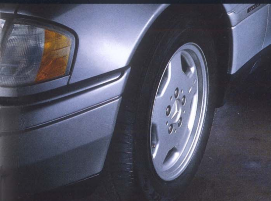
205/60R15 performance tires