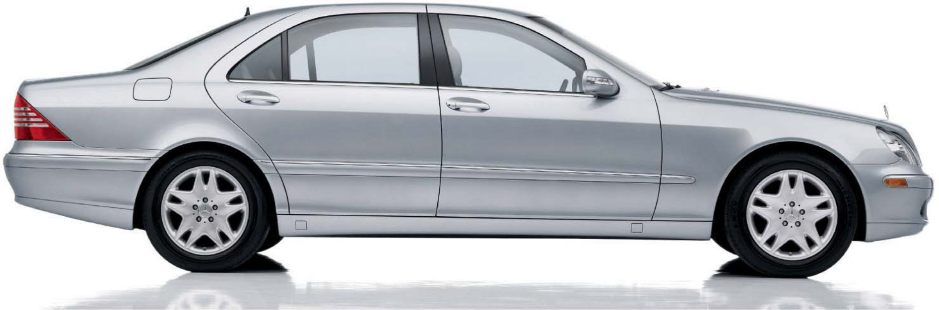
S 500 Sedan shown with optional tire-pressure monitoring system.

S 430 Sedan S 500 Sedan S 600 Sedan S 55 AMG Sedan