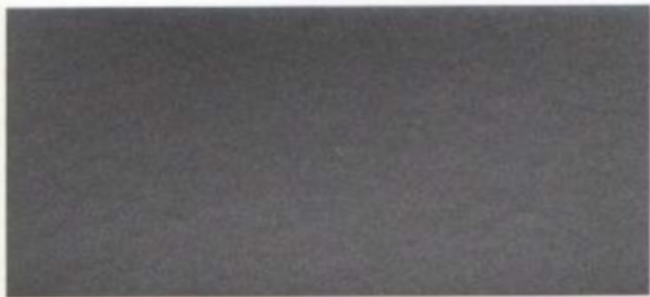
platinum graphite (K51)