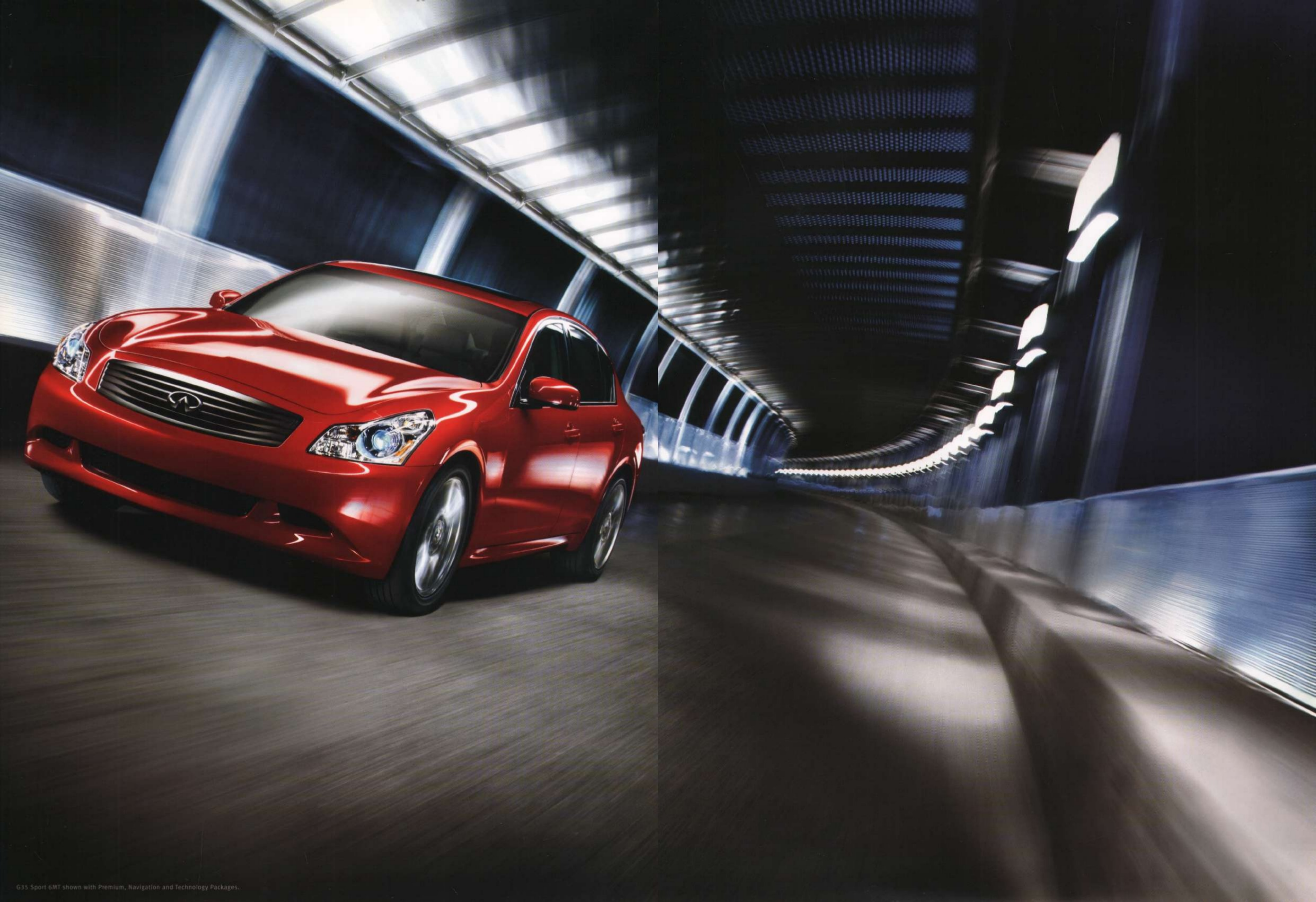
G35 Sport 6MT shown with Premium, Navigation and Technology Packages.