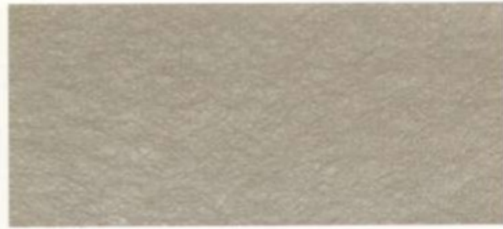
washi-finish aluminum (standard)