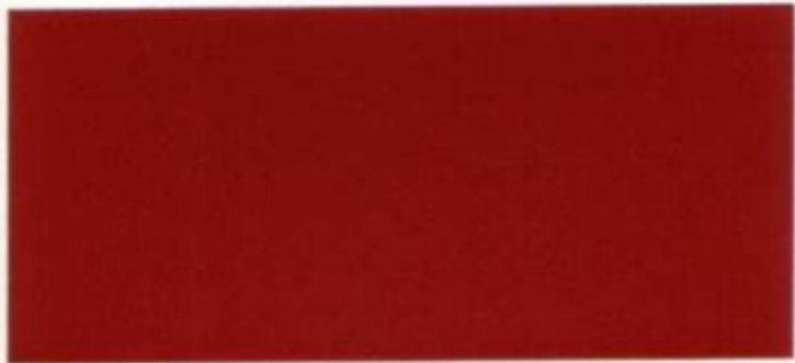
garnet ember (A51)