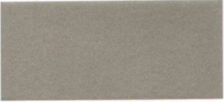
serengeti sand (K32)