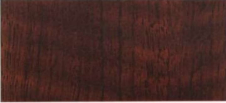
african rosewood (optional)

Build, price and locate your G Sedan at Infiniti.com