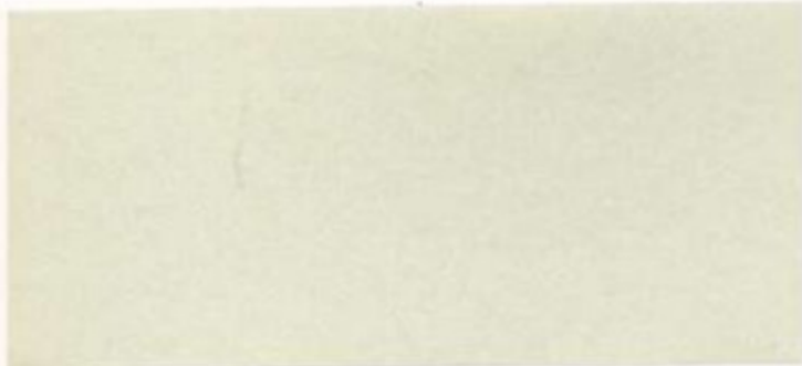
ivory pearl (QX1)

Contact your local Infiniti retailer to learn more about Genuine Infiniti Accessories and about financing accessories when purchasing your new Infiniti.