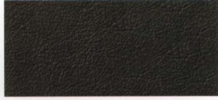
graphite leather (G)