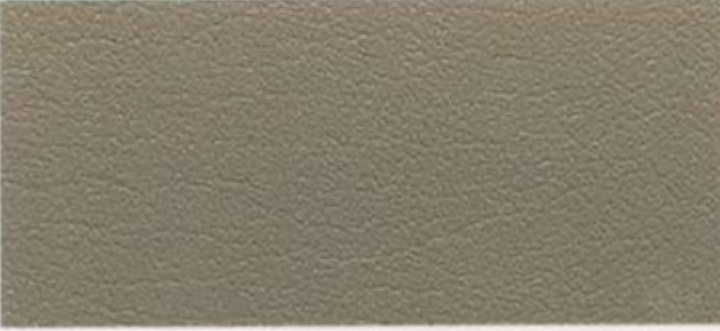
stone leather (W)