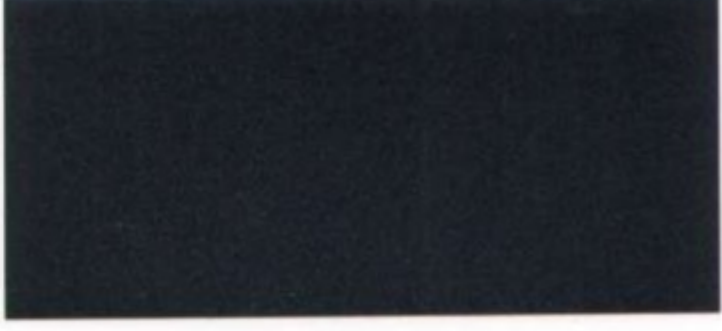
blue slate (K52)