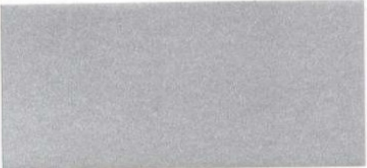
liquid platinum (K23)