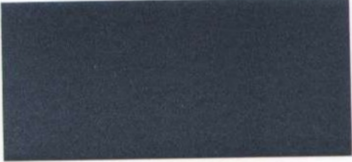
lakeshore slate (B30)