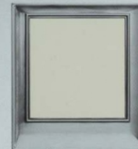
WHITE CHOCOLATE TRI-COAT