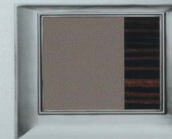
MEDIUM LIGHT STONE LEATHER/ GREYSTONE ENVIRONMENT WITH EBONY WOOD