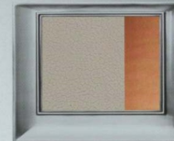
SAND LEATHER/ MEDIUM CAMEL ENVIRONMENT WITH FIGURED MAPLE WOOD