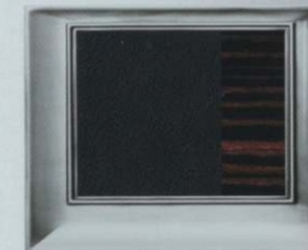
CHARCOAL BLACK LEATHER/ CHARCOAL BLACK ENVIRONMENT WITH EBONY WOOD