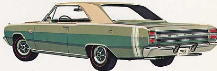
Dart GTS 2-Door Hardtop

OTHER STANDARD EQUIPMENT FEATURES ARE LISTED ON PAGE 11 ALONG WITH 23 STANDARD SAFETY FEATURES.