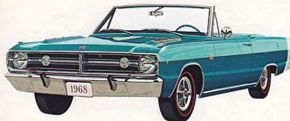
Dart GTS Convertible