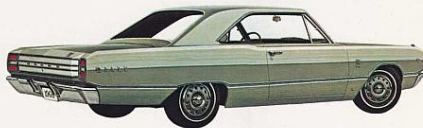
Dart GT 2-Door Hardtop

OTHER STANDARD EQUIPMENT FEATURES ARE LISTED ON PAGE 11 ALONG WITH 23 STANDARD SAFETY FEATURES.