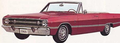
Dart GT Convertible