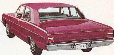
Dart 4-Door Sedan

OTHER STANDARD EQUIPMENT FEATURES ARE LISTED ON PAGE 11 ALONG WITH 23 STANDARD SAFETY FEATURES.