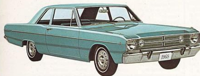
Dart 2-Door Sedan