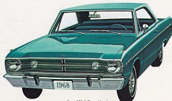
Dart 270 4-Door Sedan

OTHER STANDARD EQUIPMENT FEATURES ARE LISTED ON PAGE 11 ALONG WITH 23 STANDARD SAFETY FEATURES.