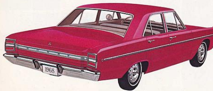
Dart 270 4-Door Sedan