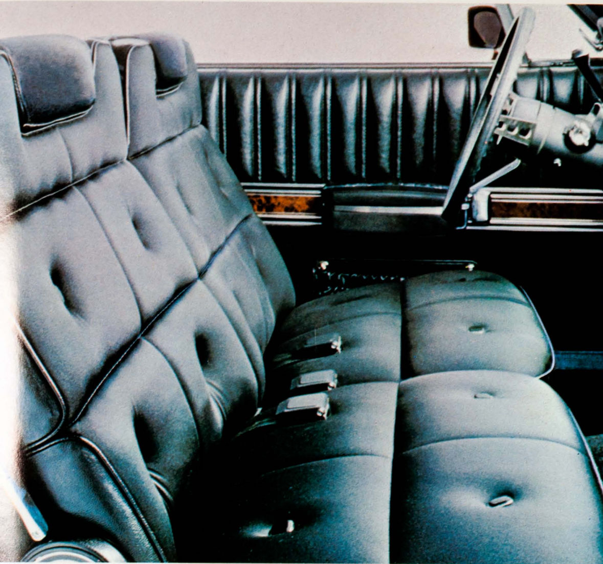
Left: Standard Brougham interior. Shown in black fabric. Other colors: blue, green and tan. Optional perforated vinyl available.