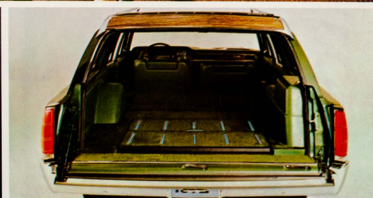
Left: Access to over 90 cu. ft. of cargo area is through the Dual Swing tailgate.