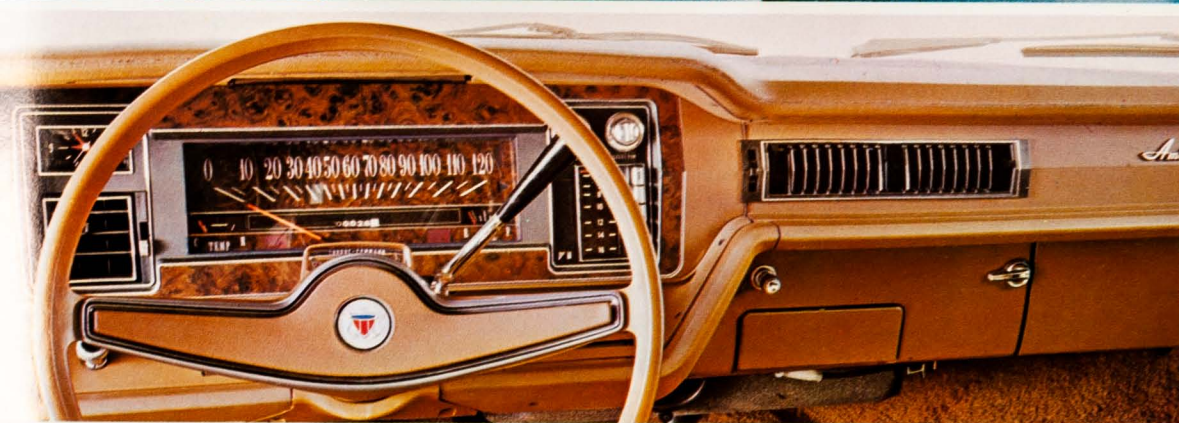
Left: SST instrument panel. Bright but not glaring. Readable but not garish.