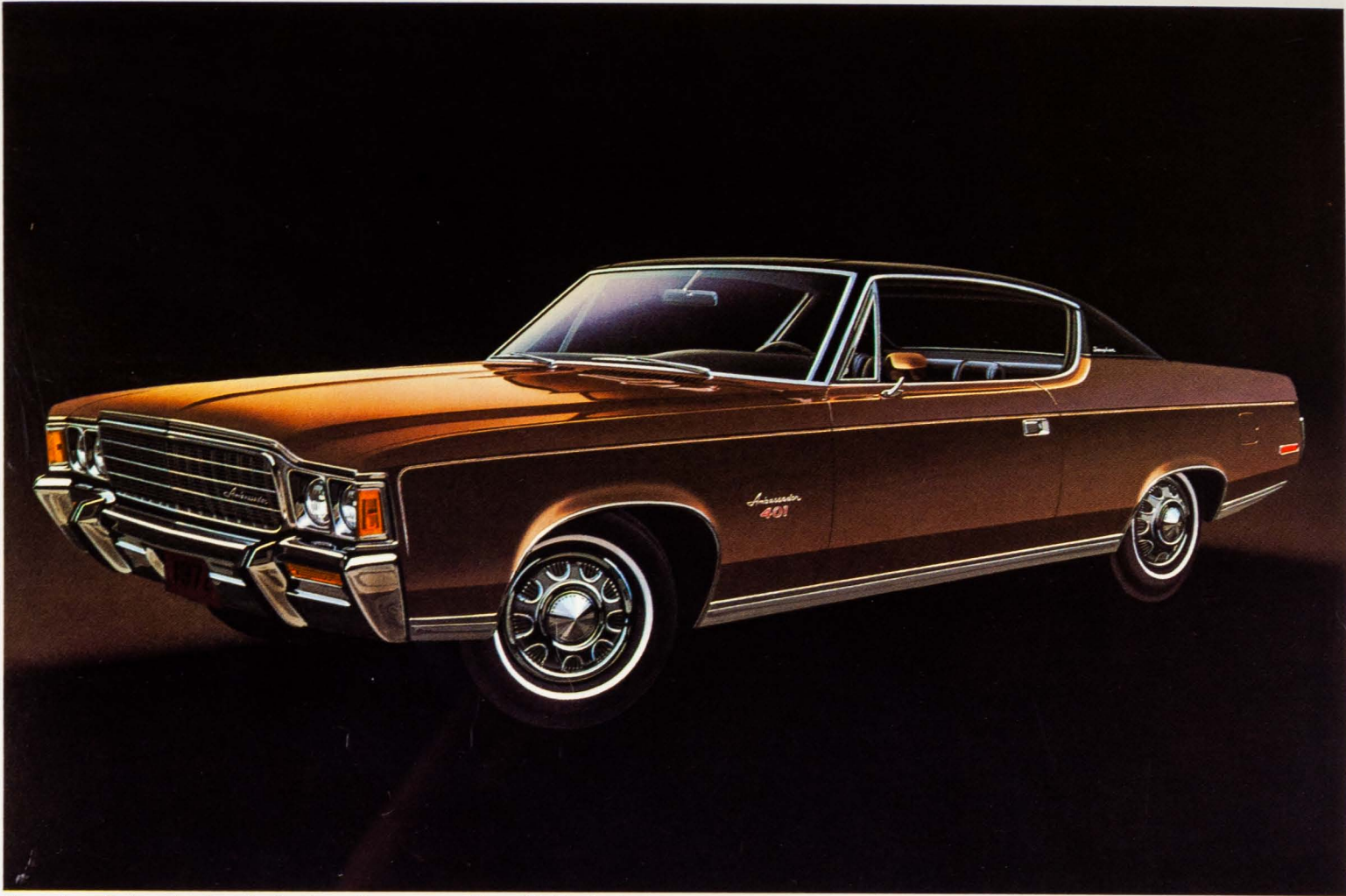
Brougham 2-door hardtop in Cordova Brown, metallic, with black vinyl top.