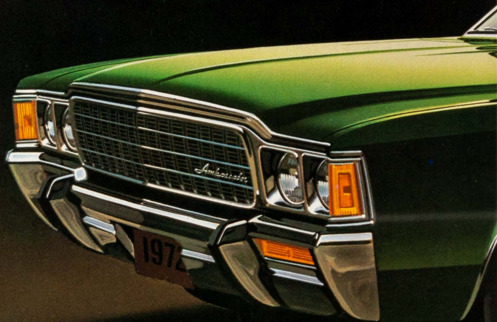
SST 2-door hardtop in Hunter Green, metallic, with white vinyl top.

In all the world, Ambassador is one of the few fine motor cars to offer such an extensive catalog of standard equipment. Air conditioning, "Torque-Command" automatic transmission, V-8 engine and now power brakes. There are two Ambassador lines and six models in all. Ambassador SST 2-door Hardtop, 4-door Sedan and 4-door Wagon — Ambassador Brougham 2-door Hardtop, 4-door Sedan and 4-door Wagon. Ambassador looks like a luxury car and behaves like one. Wheelbase is a long, smooth-riding 122". Seats are coil spring cushioned and coil spring suspension on all four wheels. Big in power, Ambassador performs almost effortlessly with its standard 304 CID V-8. A 360-CID V-8 (two or four barrel carburetor) and a 401 CID V-8 are optional. Individually adjustable "infinitely-variable" front reclining seats are one of the many optional features that mark Ambassador as one of the world's outstanding automobiles.