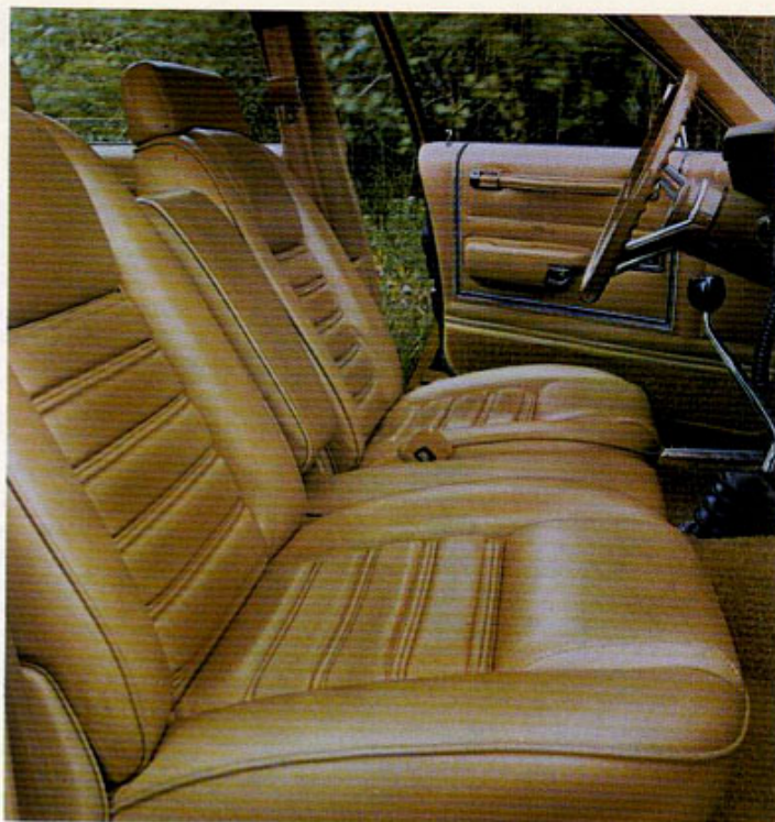
Optional Vinyl Bucket Seats

Wagon interior selections range from a standard all-vinyl bench seat to optional all-vinyl bucket seats. A Custom Interior Package and a Special Edition Interior Package are also available at extra cost. Aspen gives you plenty of comfort . . . and seating selection.