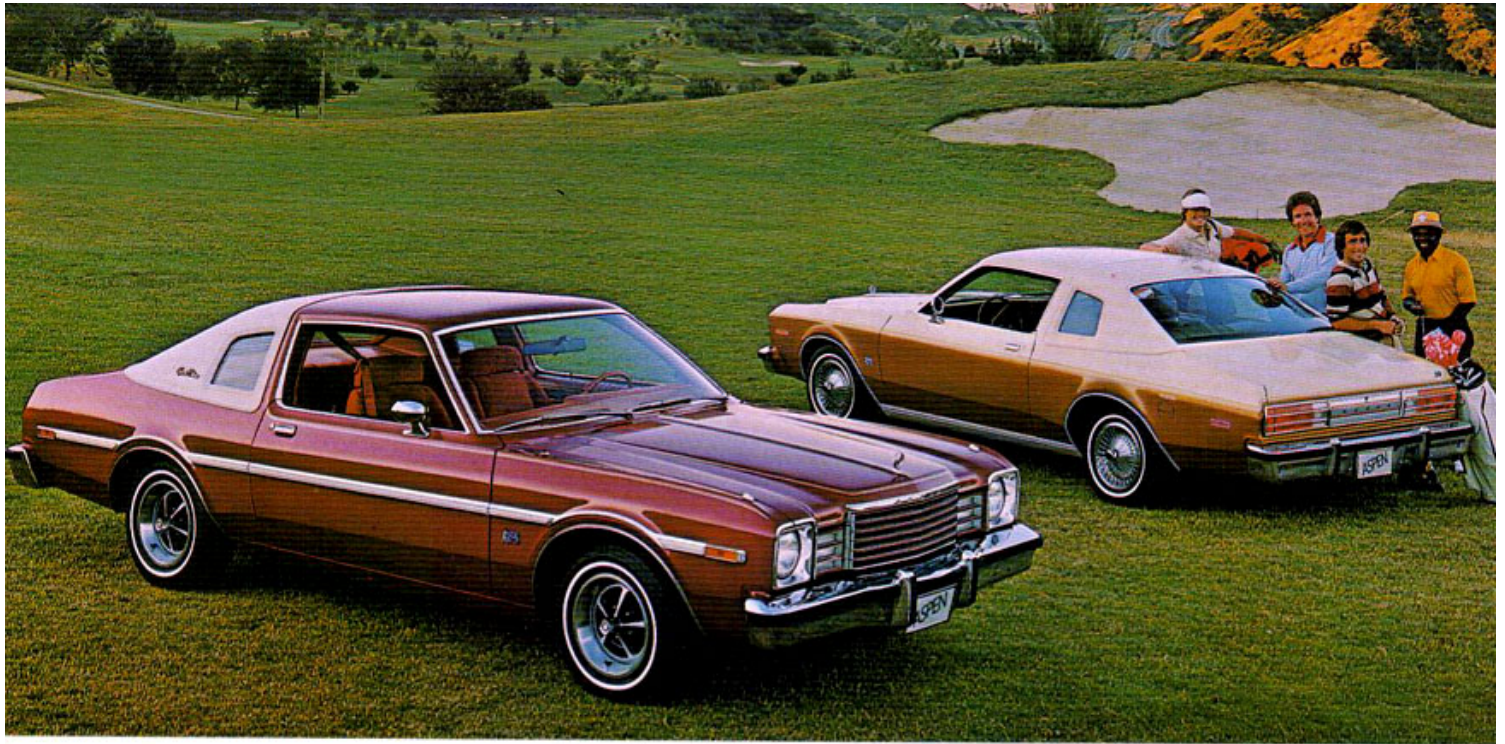
Aspen Special Edition (foreground) and Aspen Custom (background) Two-Door Coupes

suspension, leaf springs in the rear, Oriflow shock absorbers, and sound insulation, you have a car that's really quiet and handles beautifully on all kinds of roads.