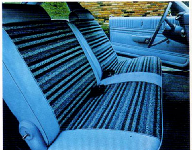
Standard Cloth-and-Vinyl Bench Seat