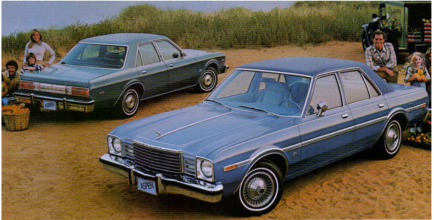
Aspen Special Edition (foreground) and Aspen (background) Four-Door Sedans

No car is the one and only answer to the private transportation needs of all Canadians. Your individual requirements such as economy, family size, handling and maneuverability, styling, durability and price range are a part of the Dodge Aspen story.