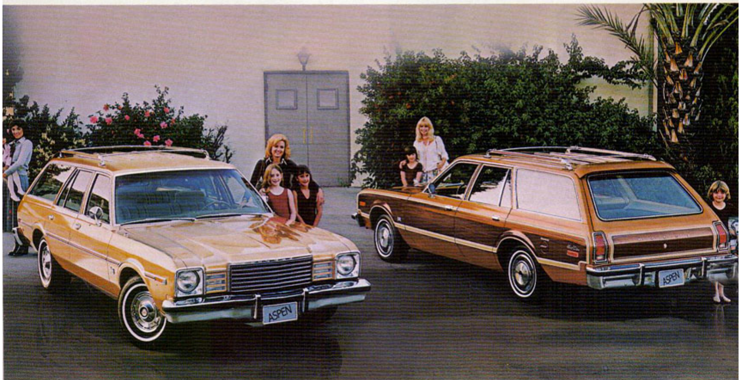
Aspen Custom (left) and Aspen Special Edition (right) Station Wagons

Inside, there's room for six adults. That's a by-product of the space-saving, strong, all-welded construction. That's Unibody and when you combine it with torsion-bar front