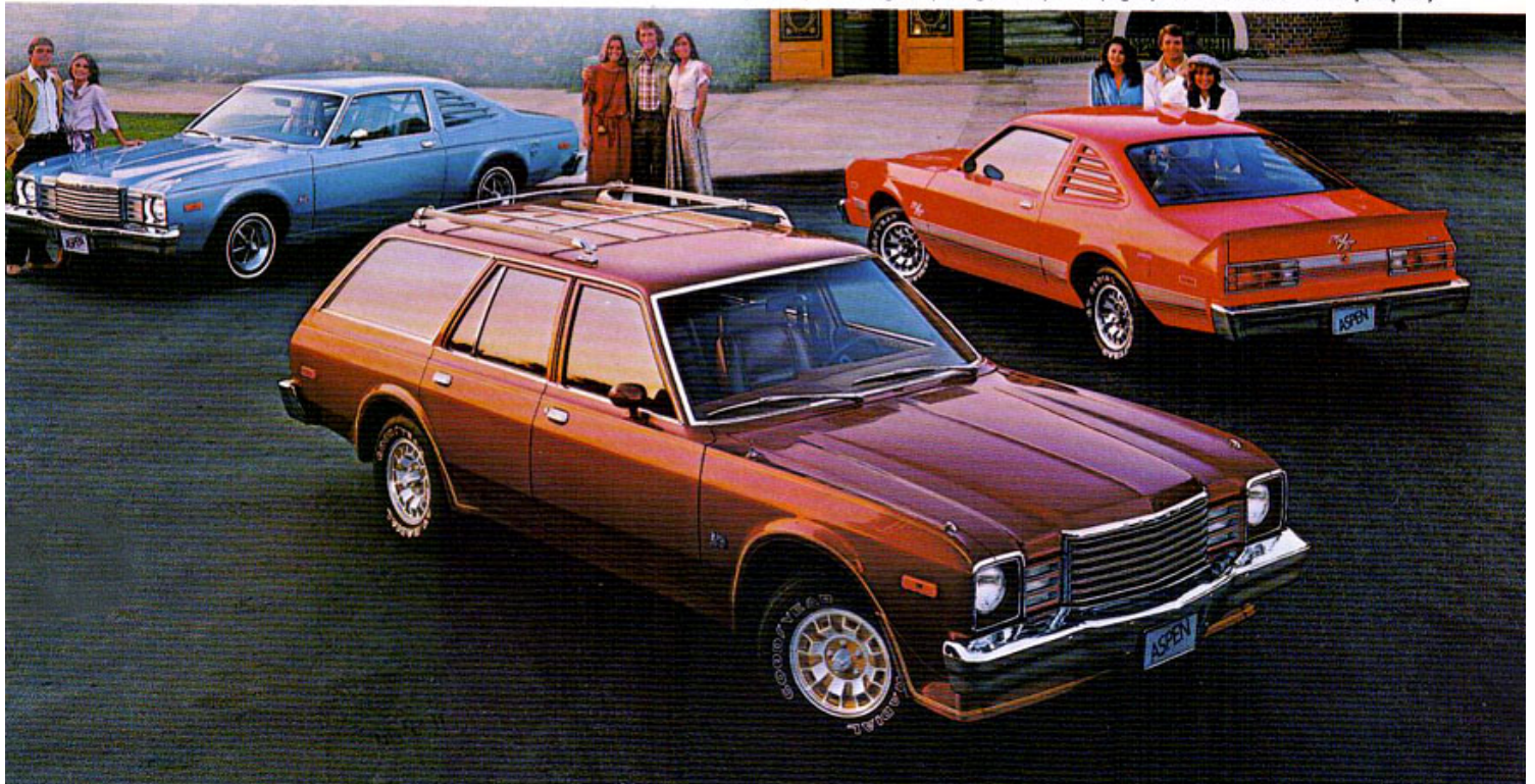
Aspen Sport Wagon (foreground) RT (right) and Sun Rise Coupe (left)

Try Dodge Aspen . . . price Dodge Aspen . . . before you buy or lease.