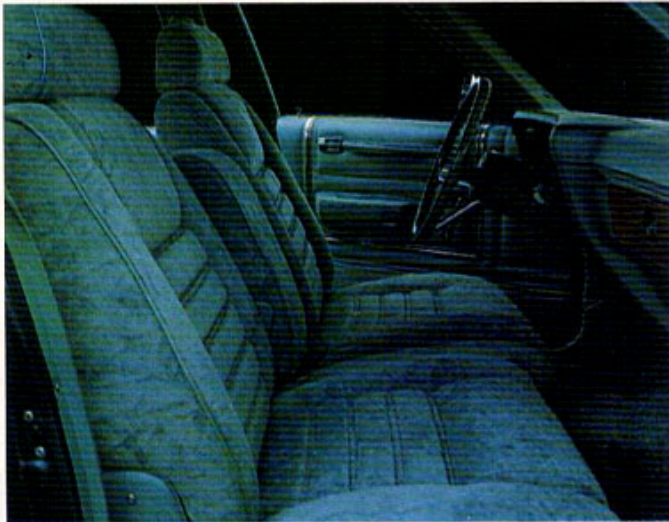
Optional 60/40 Cloth Bench Seat

A combination of good looks and safety with woodgrain instrument cluster and easy-to-read gauges. Variable intensity lights, "key-left-in-ignition" warning buzzer and parking brake warning light are also included.