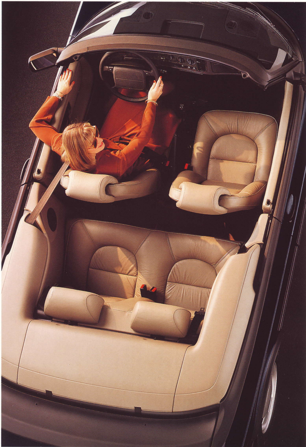
The Saab 900 Turbo Convertible and the 900S Convertible offer firm, sculptured seats with leather seating surfaces, which help to keep four adults comfortable on even the longest journeys.