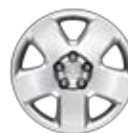
17" Wheel Cover Std. SE