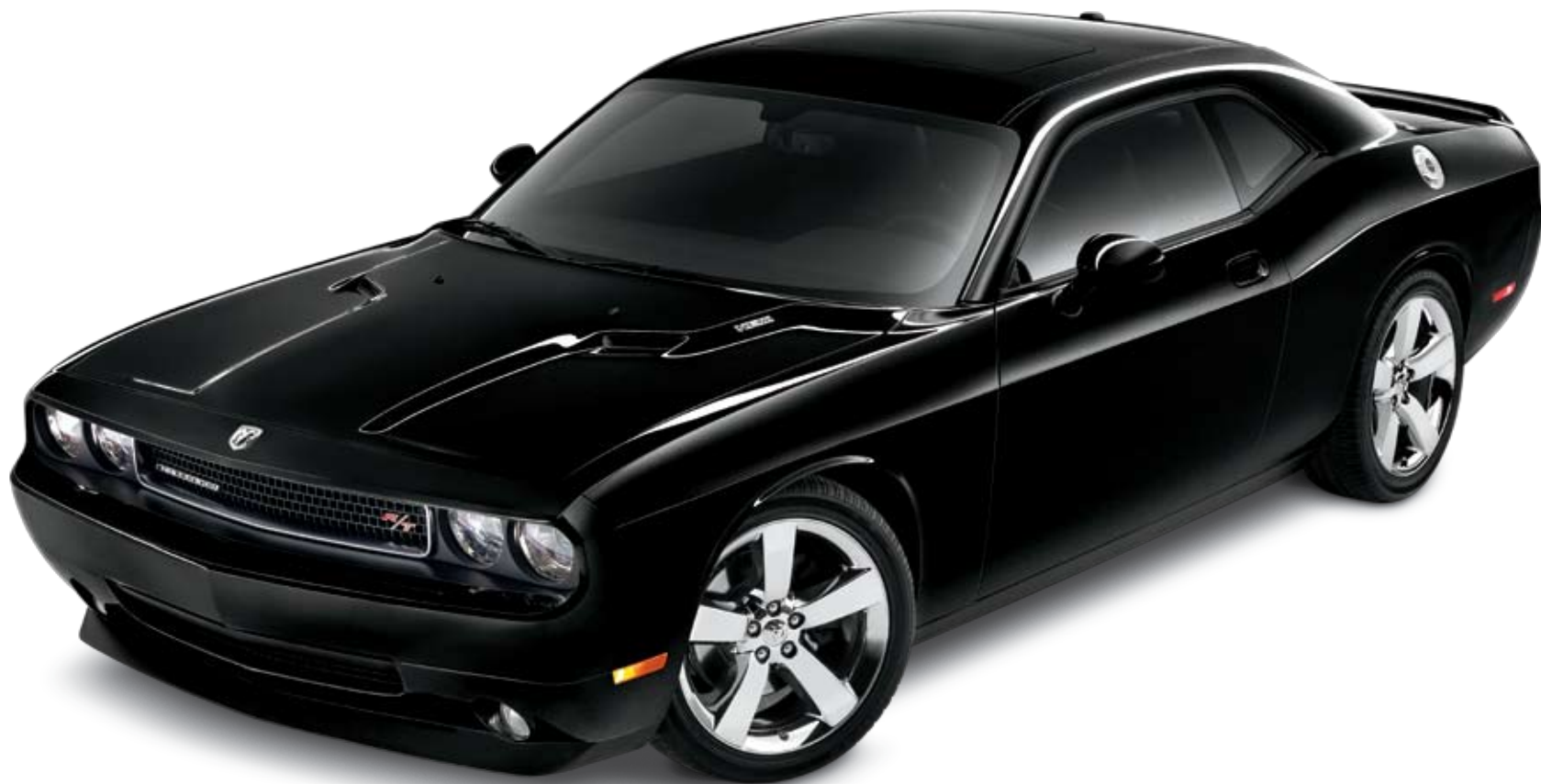
R/T shown in Brilliant Black Crystal Pearl.