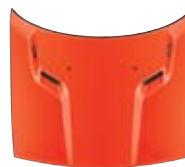
Hemi Orange R/T only

*Limited availability. Since the time of printing, some of the information you'll find in this brochure may have been updated. Specifications and all competitive comparisons are as accurate as known at the time this publication was approved for printing.