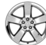
20" Chrome-clad Cast Aluminum Opt. R/T