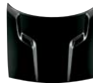
Brilliant Black Crystal Pearl