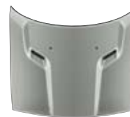
Bright Silver Metallic