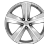
20" SRT® Forged Aluminum Std. on SRT8®