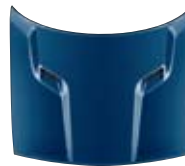
Deep Water Blue