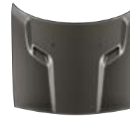
Dark Titanium Metallic