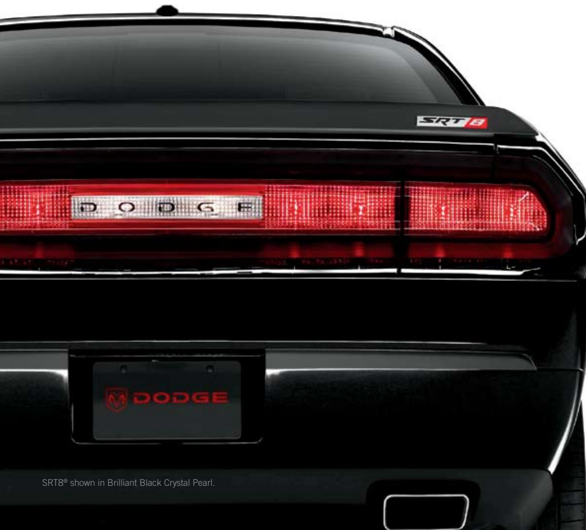
SRT8® shown in Brilliant Black Crystal Pearl.