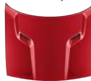
Inferno Red Crystal Pearl