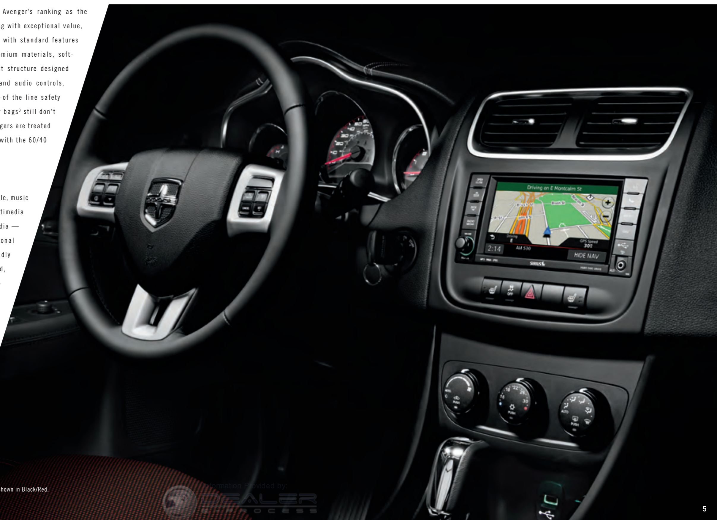
Avenger SXT shown in Black/Red.