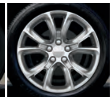
18-INCH RALLYE DESIGN ALUMINUM Standard on R/T (WPK)