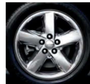
18-INCH CHROME-CLAD ALUMINUM Available on SXT (WPL)