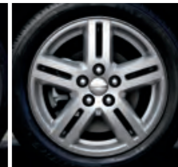
17-INCH ALUMINUM Available on CVP (WFJ)