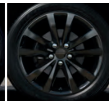
18-INCH GLOSS BLACK ALUMINUM Included with Blacktop Group on CVP and SXT (WPE)