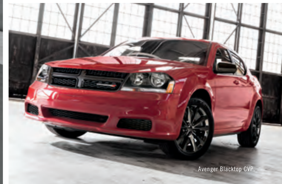
Avenger Blacktop CVP.