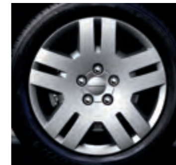
17-INCH WHEEL COVER Standard on CVP (W7A)