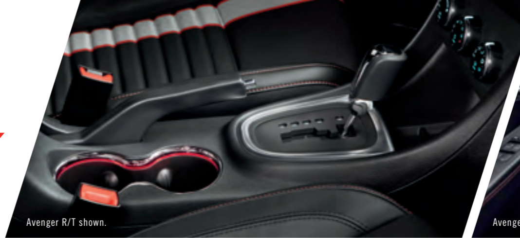
Avenger R/T shown.