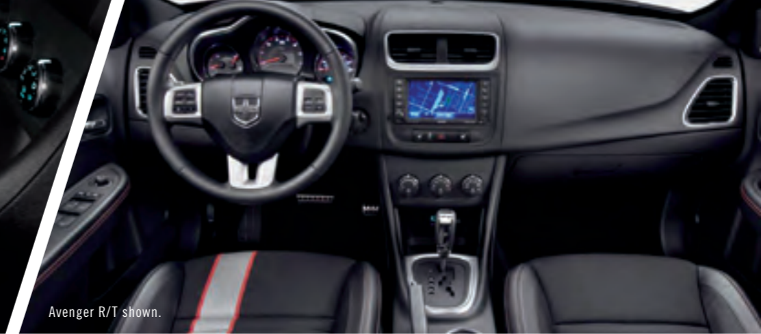
Avenger R/T shown.