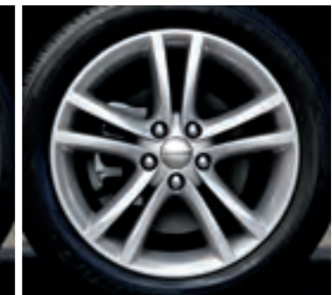
18-INCH CAST ALUMINUM Standard on SXT (WPT)