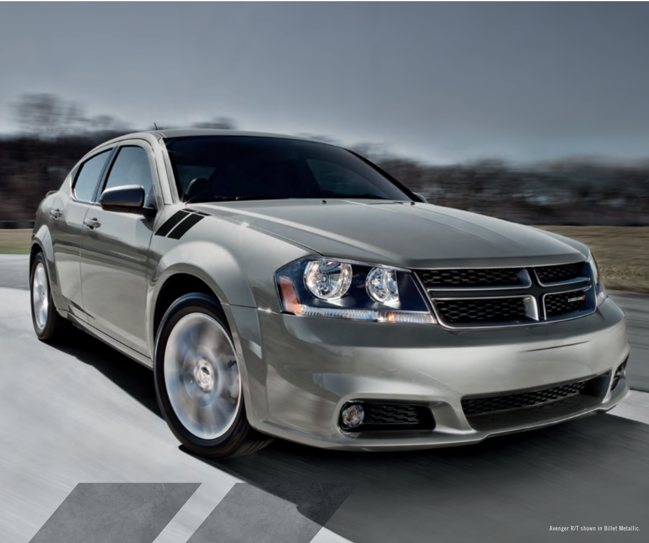
Avenger R/T shown in Billet Metallic.

BUILT TO HUSTLE. Designed to deliver power and performance, Avenger offers two formidable engine options: the 2.4L I-4 delivering up to 6.4 L/100 km (44 mpg) highway* and the award-winning 3.6L Pentastar™ Variable Valve Timing (VVT) V6 with 283 horsepower and up to 6.8 L/100 km (42 mpg) highway.*