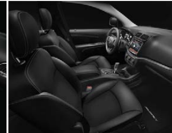
[3] Leather-faced with Sport mesh inserts — Black with Light Slate Grey accent stitching Standard on Crossroad FWD