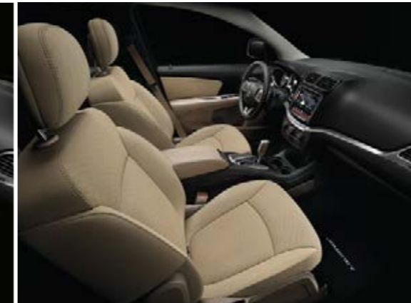
[2] Cloth — Light Frost Beige Standard on CVP, SE Plus, SXT and Limited