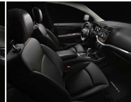
[7] Leather-faced with perforated inserts — Black with Red accent stitching Standard on R/T Rallye