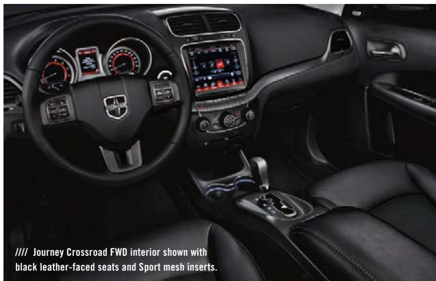
//// Journey Crossroad FWD interior shown with black leather-faced seats and Sport mesh inserts.

It's time for your next adventure. With a bold, rugged exterior, a refined interior and available all-wheel-drive (AWD) capability, Journey Crossroad is game for anything. Boasting an exterior design furnished with Platinum Chrome-accented side roof rails, lower bodyside mouldings, and front and rear fascias, Journey Crossroad stands apart from the competition. Gloss Black fog lamp surrounds, a Gloss Black grille, black-accented headlamps and unique 19-inch Hyper Black aluminum wheels complete its exterior image. Retreat inside for a refined atmosphere of soft-touch surfaces, rich seating materials and Liquid Graphite accents. Built to escape the ordinary, Journey Crossroad is ready to help you discover new horizons.