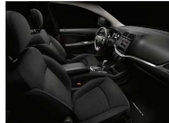
[1] Cloth — Black Standard on CVP, SE Plus, SXT and Limited