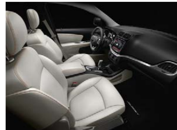
[5] Leather-faced — Pearl with Orange accent stitching Standard on R/T