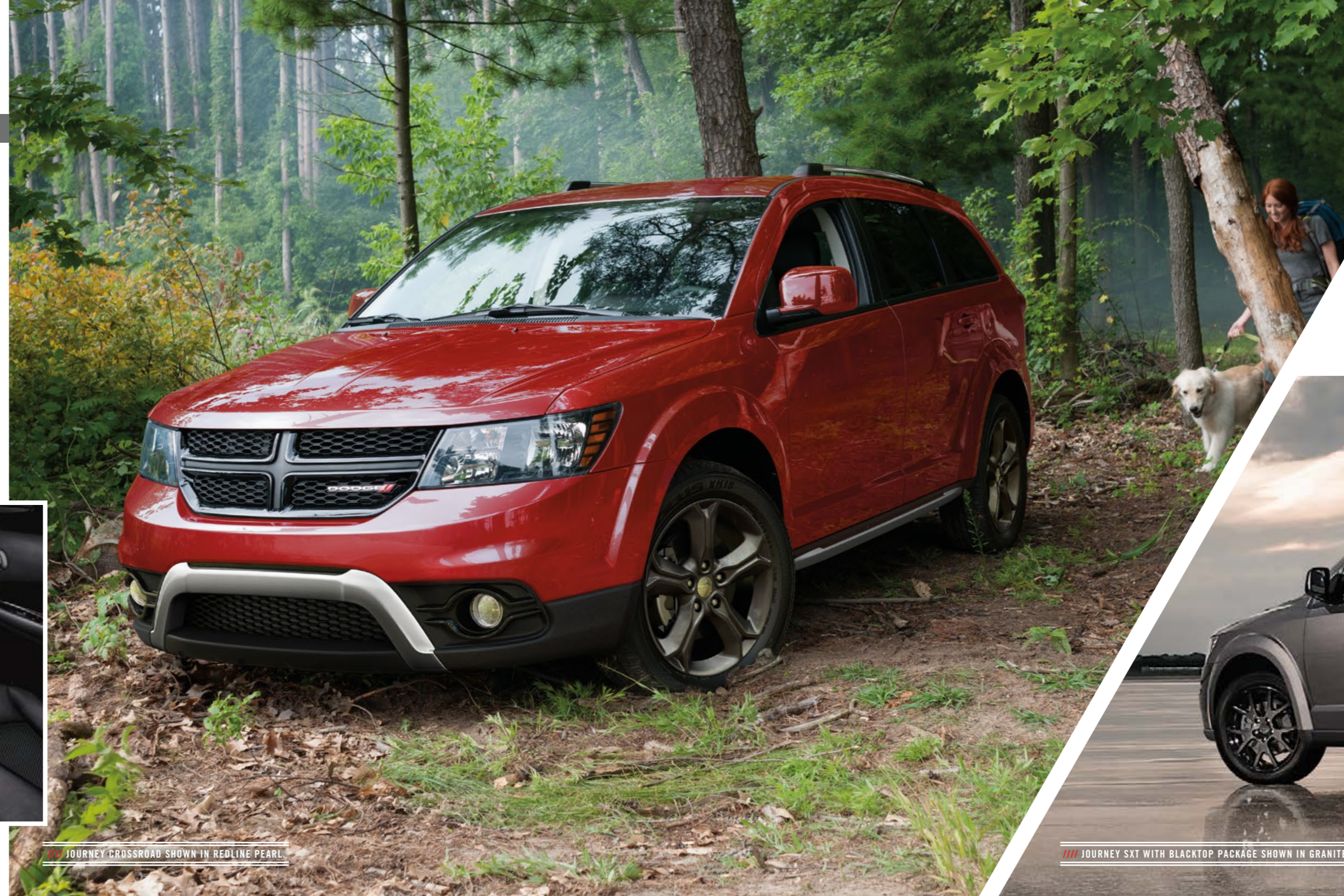
//// JOURNEY CROSSROAD SHOWN IN REDLINE PEARL.