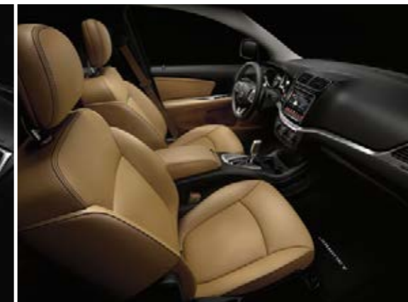
[6] Leather-faced — Tan with Dark Brown accent stitching Standard on R/T