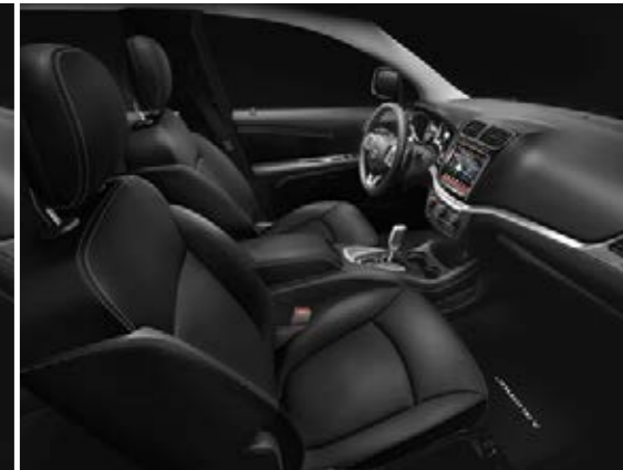
[4] Leather-faced — Black with Silver accent stitching Standard on R/T and Crossroad AWD