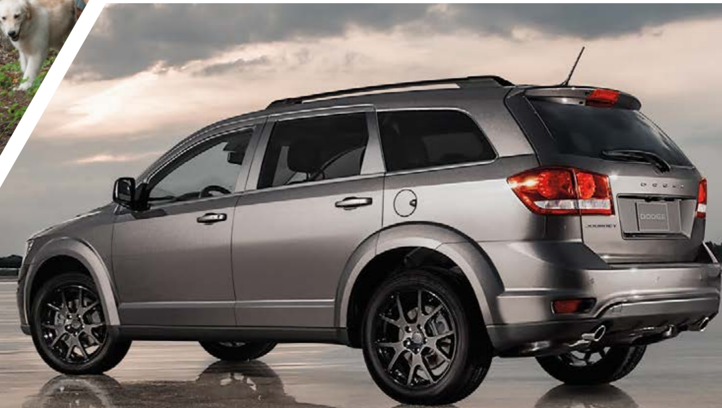
//// JOURNEY SXT WITH BLACKTOP PACKAGE SHOWN IN GRANITE CRYSTAL METALLIC.

Journey Blacktop is set apart by a bold, distinctive look, straight from the factory. Exterior accents include 19-inch Gloss Black aluminum wheels, Gloss Black front grille, lower front fascia accents and exterior mirrors, as well as black headlamp accents. Inside, you'll find a tech-savvy interior that includes the Radio 8.4 multimedia centre with an 8.4-inch touchscreen and SiriusXM satellite radio. 4