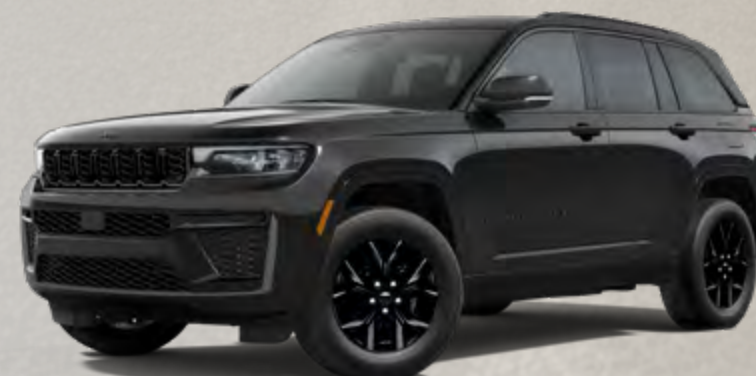
Laredo Altitude in Diamond Black Crystal Pearl