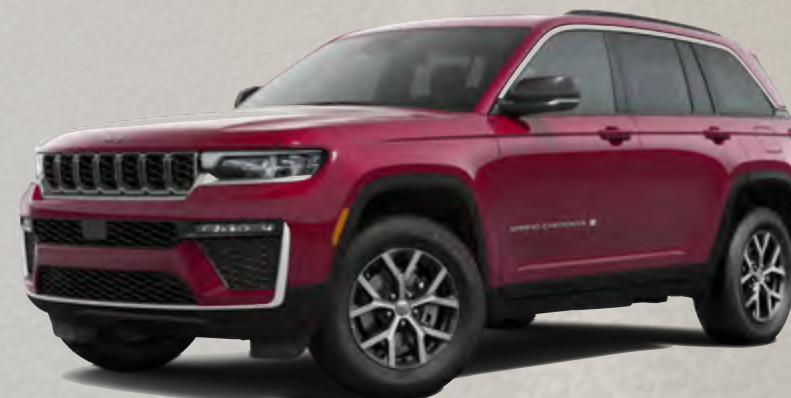
Limited in Velvet Red Pearl