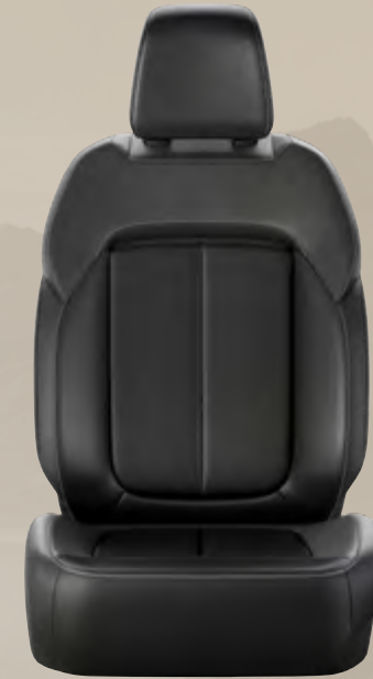
Nappa Leather and Axis II Perforated seats with Light Tungsten accent stitching — Global Black (Standard)