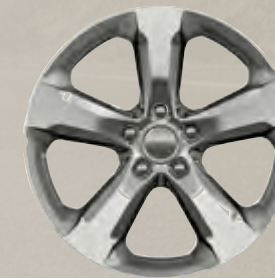
20-inch machined-face aluminum wheels with High-Gloss Tech Gray pockets (Available)