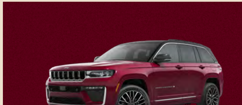
Velvet Red Pearl