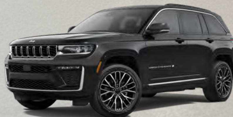
Summit in Diamond Black Crystal Pearl