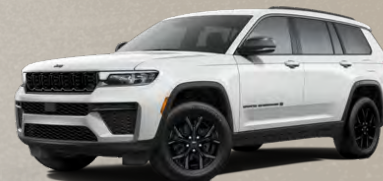
3-Row Laredo Altitude in Bright White