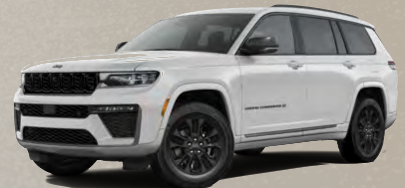
3-Row Limited Reserve in Bright White