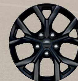
18-inch Gloss Black fully painted aluminum wheels (Standard)