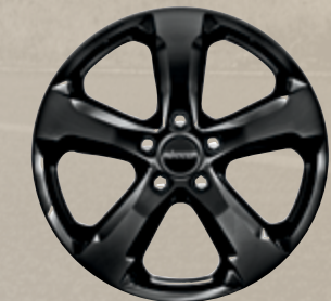
20-inch Gloss Black-painted aluminum wheels (Standard with Limited Altitude Package)