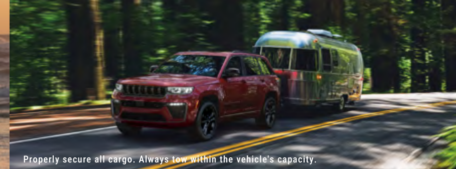
Properly secure all cargo. Always tow within the vehicle's capacity.