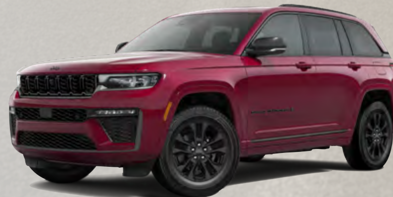
Limited Reserve in Velvet Red Pearl