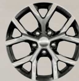
18-inch polished aluminum wheels with High-Gloss Black pockets (Standard)