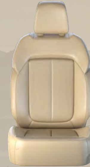
Capri Leatherette and Axis II Perforated seats with Light Tungsten accent stitching – Global Black / Wicker Beige (Standard with Luxury Tech Group II)