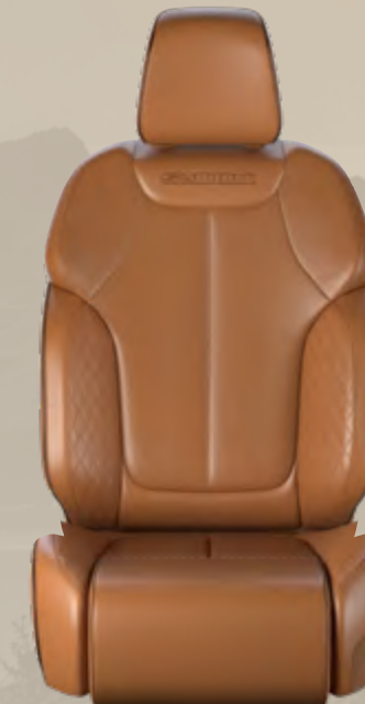
Ventilated Palermo Leather seats with Quilted Palermo Leather Bolsters, Cognac accent stitching, Global Black piping and embossed Summit logo — Tupelo / Black (Standard)