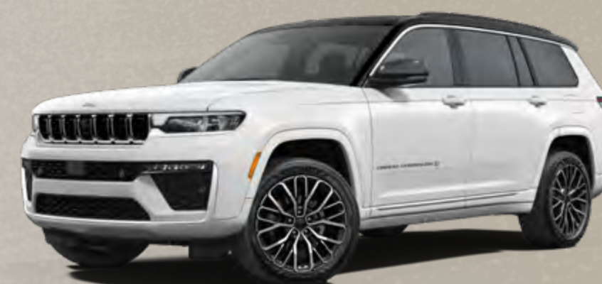
3-Row Summit in Bright White