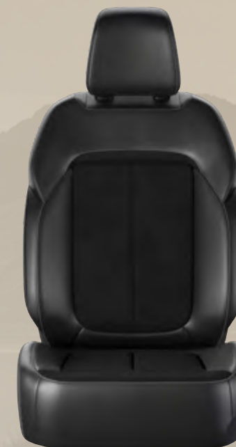
Capri Leatherette and Axis II Perforated Suede seats with Light Tungsten accent stitching — Global Black (Standard)