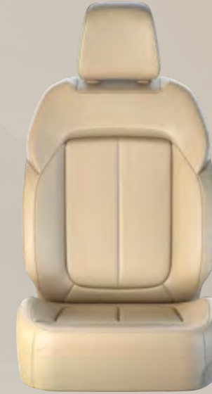
Capri Leatherette seats with Light Tungsten accent stitching – Global Black / Wicker Beige (Standard)