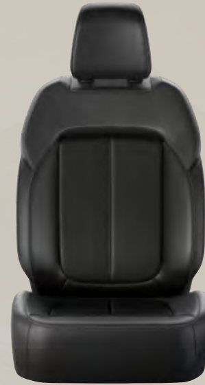
Capri Leatherette seats with Light Tungsten accent stitching – Global Black (Standard)