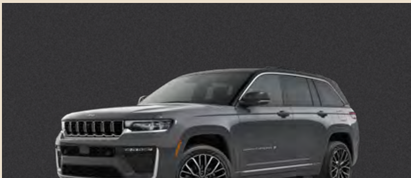
Baltic Gray Metallic