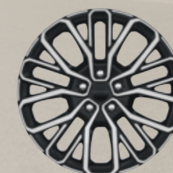
21-inch machined-face aluminum wheels with High-Gloss Black Noise pockets (Standard)