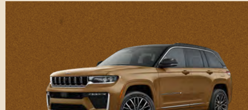
Copper Shino Metallic (Late availability)