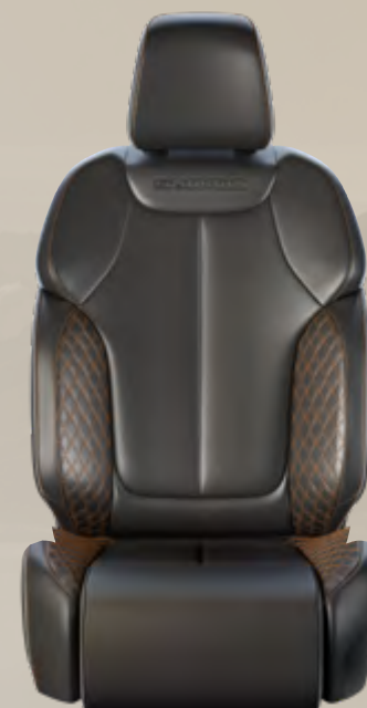
Ventilated Palermo Leather seats with Quilted Palermo Leather Bolsters, Cognac accent stitching, Steel Gray piping and embossed Summit logo — Global Black (Standard)