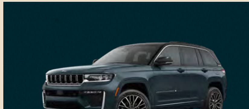
Fathom Blue Pearl (Late availability)