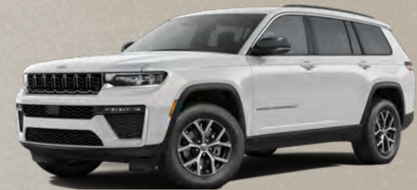
3-Row Limited in Bright White