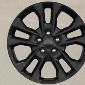
20-inch High-Gloss Black Noise-painted aluminum wheels (Standard)