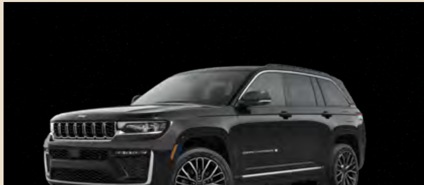
Diamond Black Crystal Pearl