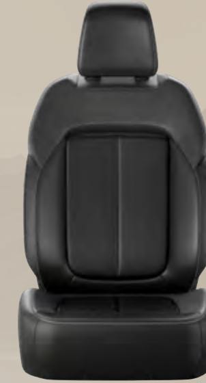
Capri Leatherette and Axis II Perforated seats with Light Tungsten accent stitching – Global Black (Standard with Luxury Tech Group II)